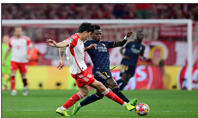
Bayern's Kim Min-jae (left) challenges for the ball with Real Madrid's Vinicius Junior during the Champions League semifinal first leg soccer match between Bayern Munich and Real Madrid at the Allianz Arena in Munich, Germany, April 30, 2024.

calm, rest until next week and we know that we and the fans are going to leave everything at the Santiago Bernabeu to qualify."