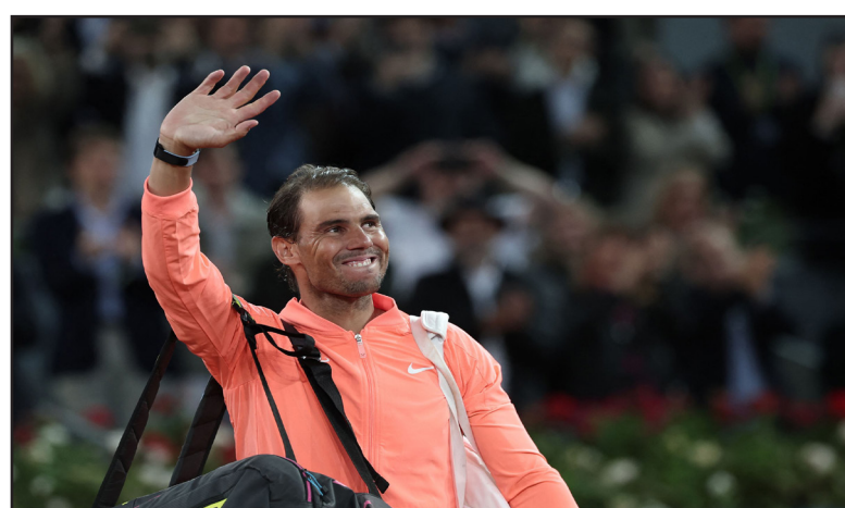
Spain's Rafael Nadal gestures after losing against Czech Republic's Jiri Lehecka during the 2024 ATP Tour Madrid Open tournament round of 16 tennis match at Caja Magica in Madrid on April 30, 2024.

With the score level at 5-5 in the first set, 30th seed Lehecka broke serve and then held his