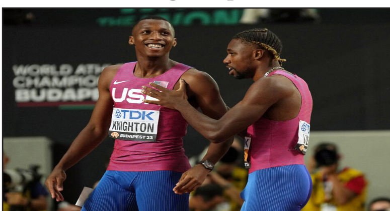
- World Athletics Championship - Men's 200m Final - National Athletics Centre, Budapest, Hungary - August 25, 2023 Noah Lyles of the U.S. reacts after winning the men's 200m final with second placed Erriyon Knighton of the U.S.

"Until I get old ... there's still going to be (comments) like, 'the young phenom' or 'I did this at this age'," he said. "They were expecting me to break the world record